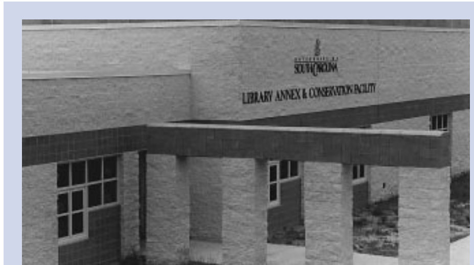
USC's Library Annex and Conservation Facility opened for business in August. Hundreds of books and other materials from the University's libraries have been transferred to the annex each week since then. For a detailed description of the activities necessary to make these transfers possible please see pages 6 and 7.

The two technology modules required of all University 101 students which are being taught in Thomas Cooper Library are Computing Resources/E-mail and Information Seeking. The modules are taught by librarians and by specially trained graduate students.