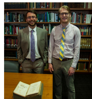
2015. Top Prize Winner

Encourage your students to submit their work for the University Libraries Award for Undergraduate Research by