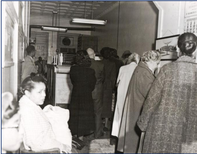
Interior, Victory Savings Bank