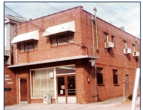
Victory Savings Bank