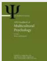
APA Handbook of Multicultural Psychology